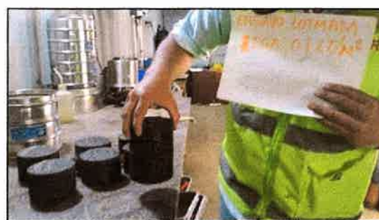
Fig. 2. Adherence of the two pastes