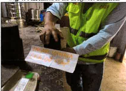
Fig. 8. Placement of the dough for adhesion.