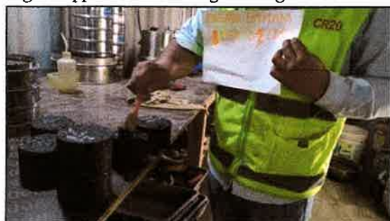
Fig. 3. Application of the ligator irrigation with 0.2 l/m2