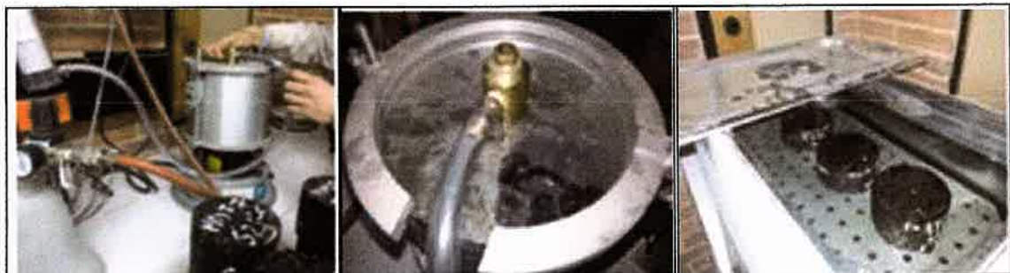
Fig. 15. Rice Test and Samples in the Bain-Marie to start with the Lottman rupture tests