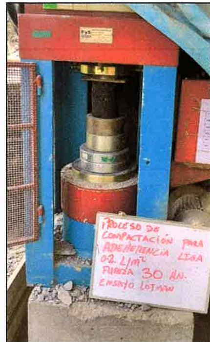
Fig. 10. Compaction Rate 0.2 l/m 2 kgf. 30 KN