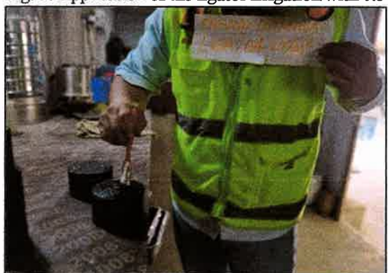
Fig. 7. Application of the ligator irrigation with 0.4 l/m2