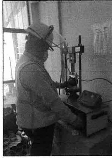
Fig. 16. Lottman test of conditioned briquette breakages with different league irrigation rates.