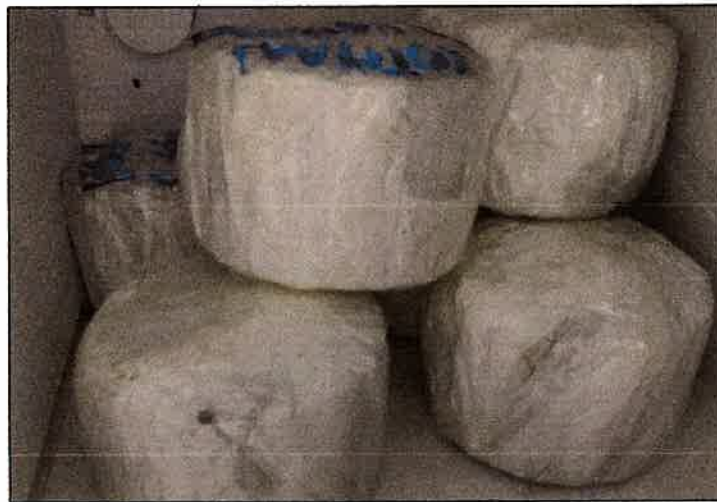
Fig. 14. Preparation of the pastes for the Lottman test for the freeze-thaw cycle

The Lottman test can only be performed when a final design is available.