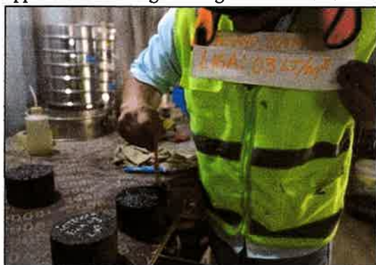
Fig. 5. Application of the ligator irrigation with 0.3 l/m2