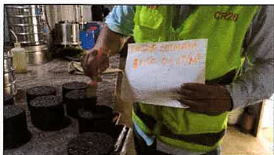
Fig. 1. Application of the ligator irrigation with 0.1 l/m2