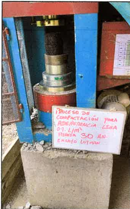
Fig. 9. Compaction Rate 0.1 l/m 2 kgf. 30 KN

Compaction test by Means of a concrete press taking into account the Mtc E - 513 standard