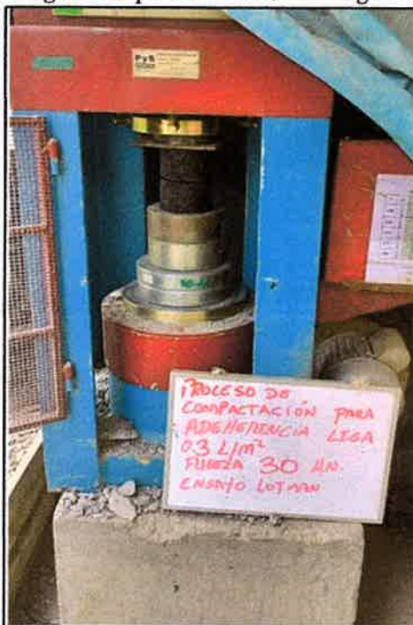
Fig. 11. Compaction Rate 0.3 l/m 2 kgf. 30 KN