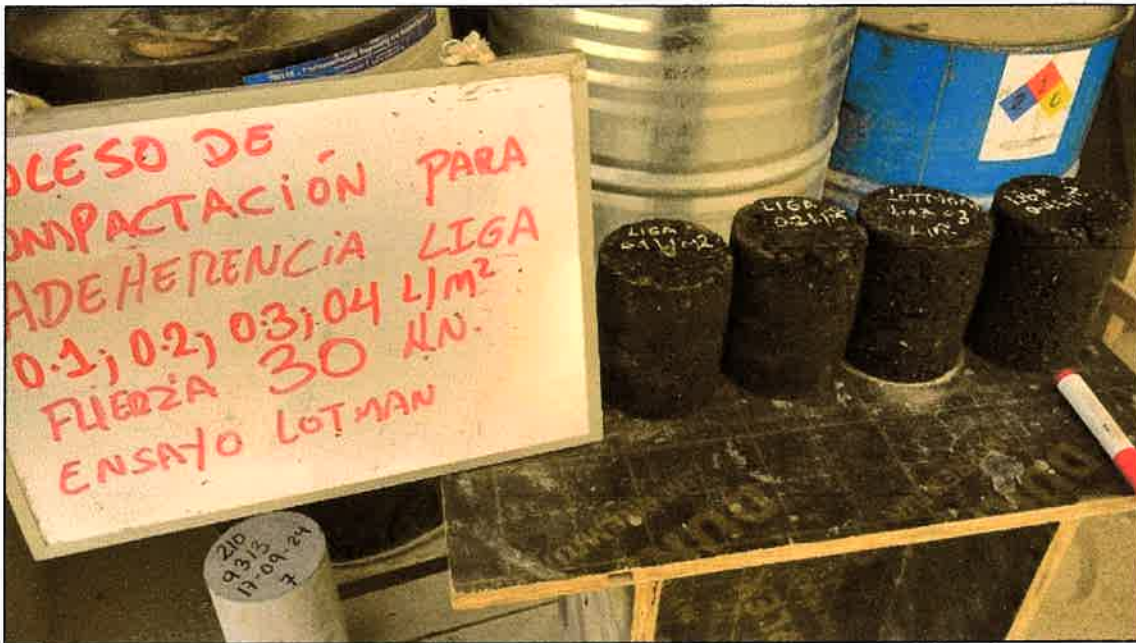
Fig. 13. Group of pastons enabled for the Lottman test