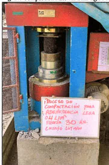
Fig. 12. Compaction Rate 0.4 l/m 2 kgf. 30 KN